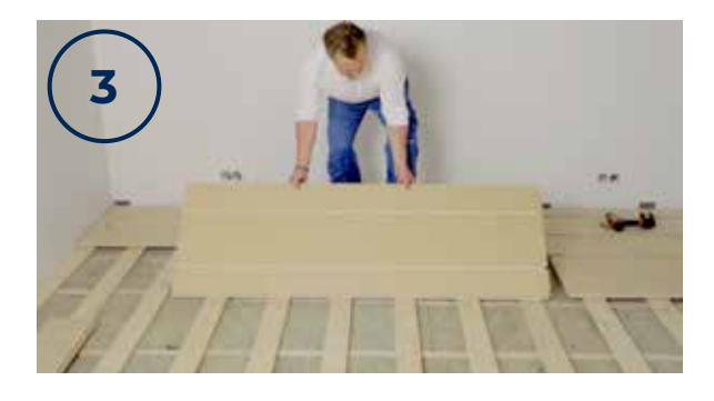
It is recommended to start installation at the furthest place from the water manifold to enable easy installation of the transfer pipes between the piping and the manifold.

Before installation, the moisture content of the KoskiTherm boards should be stabilized close to the conditions of use. The boards should be stabilized for 5–7 days, depending on the initial moisture content. The boards should be separated with battens whilst being stabilized.