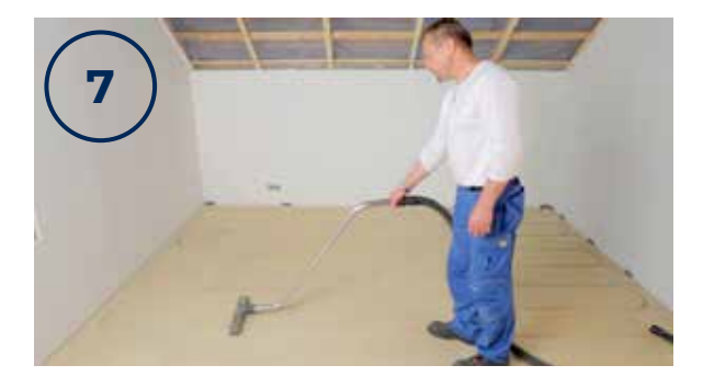
Before installing the heat transfer plates, the floor and the piping grooves should be cleaned of sawdust and other dirt.

To allow for the wood's natural movement in service, the boards should be laid so, that a gap of at least 10mm is left between the boards and the walls and between the rooms. If the KoskiTherm boards are installed directly on battening, the extension joint of a turn board should be installed and screwed on the battening. When installing on spaced boarding, the extension joint of a turn plate should not necessarily be on top of the battening.